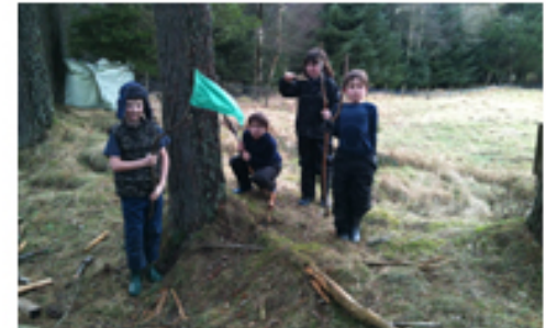
Gathering for an impromptu parade!